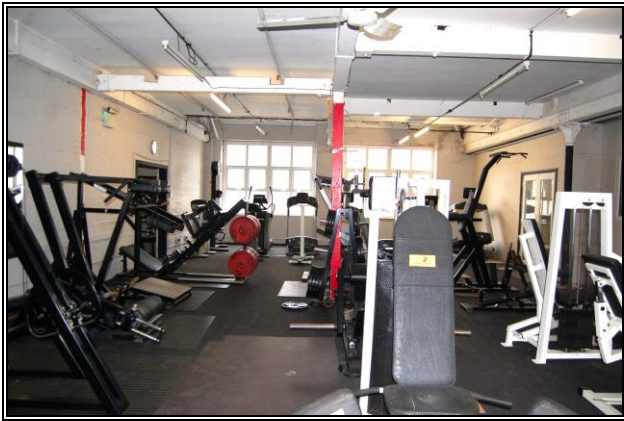
Gym Area 1