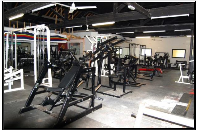
Gym Area 2